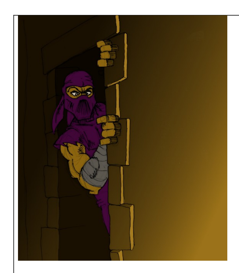
Close up of the ninja as he looks past the camera, then to the side, and suddenly runs out of view.